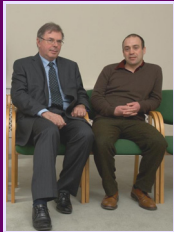
Directors in chairs: a rare moment in a busy schedule