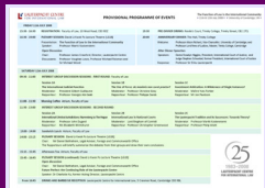
Our 25 th Anniversary celebrations in July promise to be one of the great events in this year's international law calendar. The provisional programme is attached to this FTD.

If you have any Alumni or Centre-related news you would like others to hear about, do let us have it via email to admin@lcll.cam.ac.uk