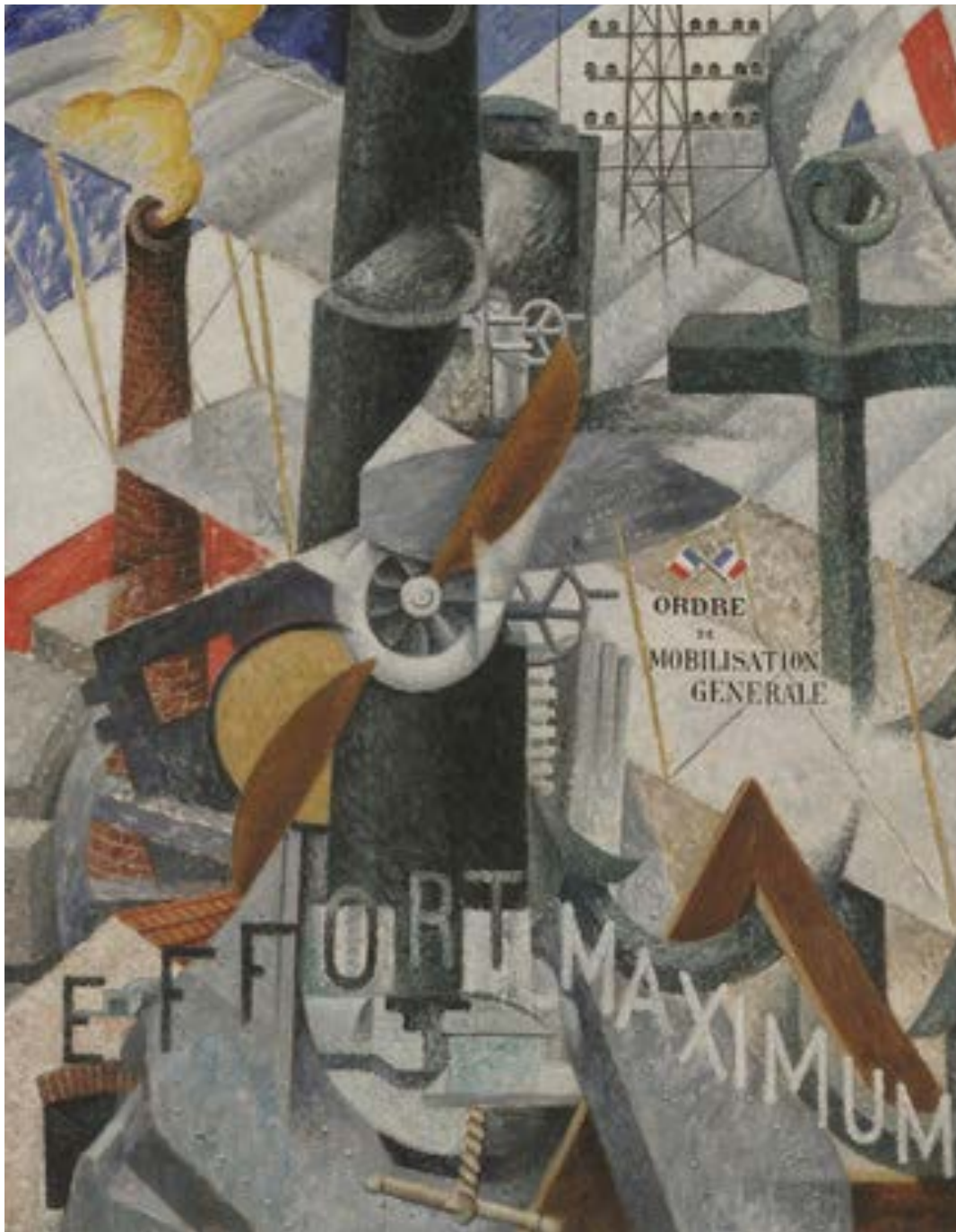
Gino Severini, Visual Synthesis of the Idea: “War” (1914)