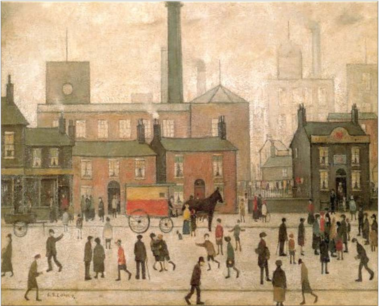
LS Lowry, Coming Home from the Mill 1928