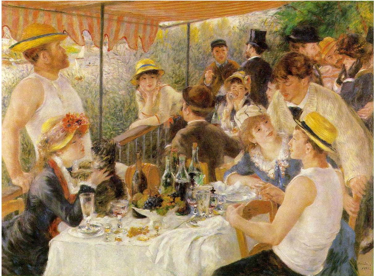
Pierre-Auguste Renoir, Luncheon of the Boating Party (1881)