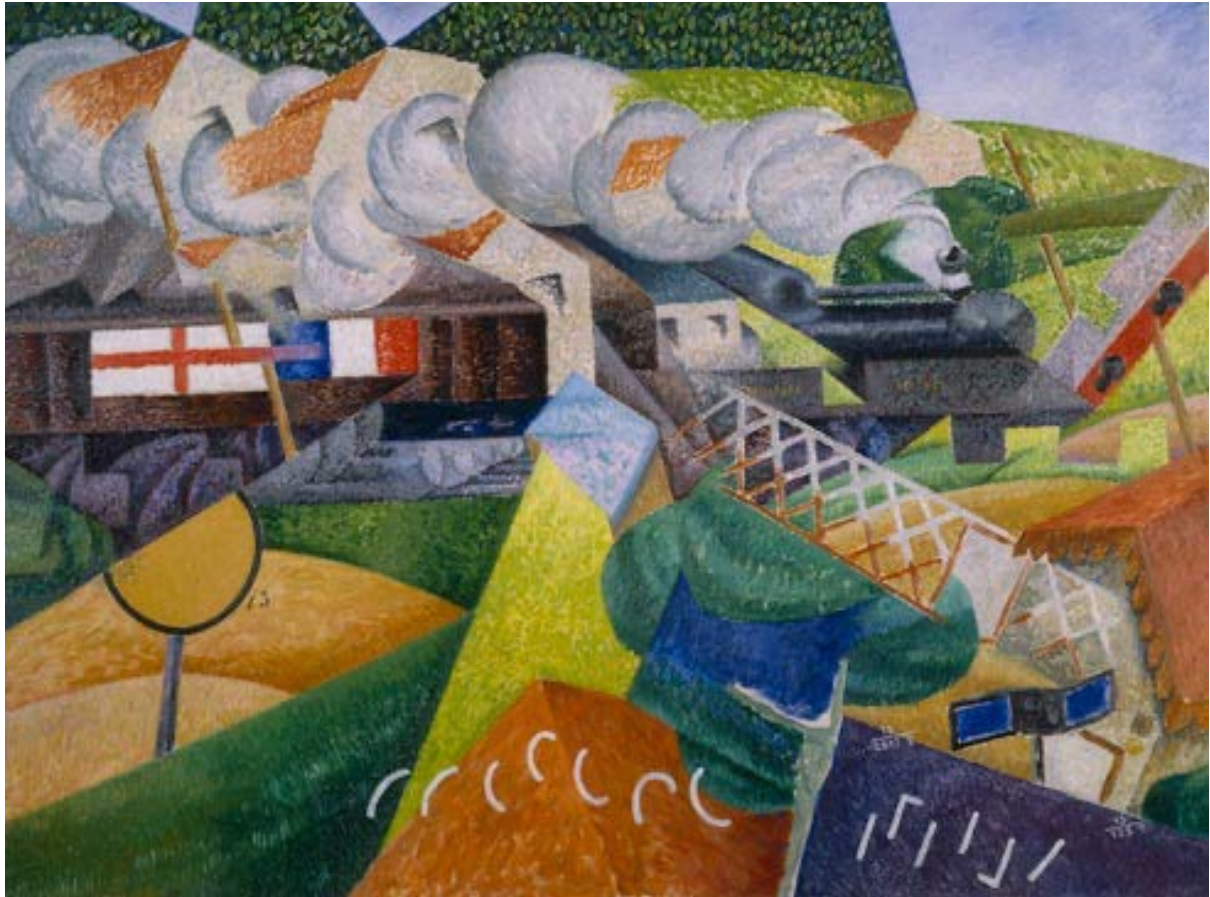
Gino Severini, Red Cross Train Passing a Village (1915)

JRC: Then a village you shall have. Red Cross Train Passing through a Village . Painted when Severini was living in the village of Igny, “surrounded by a vegetable garden”, on 4 francs a day, in 1915. 2