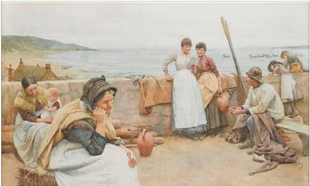
Walter Langley, A Village Idyll 1888

MK replies: Don't be silly. The Positivists are too busy counting rules, or money. Your insurgent picket is a mere ideological construct, a nationalist in search of utopia and finding only a dusty steppe. I want real life, a village, somewhere peaceful.