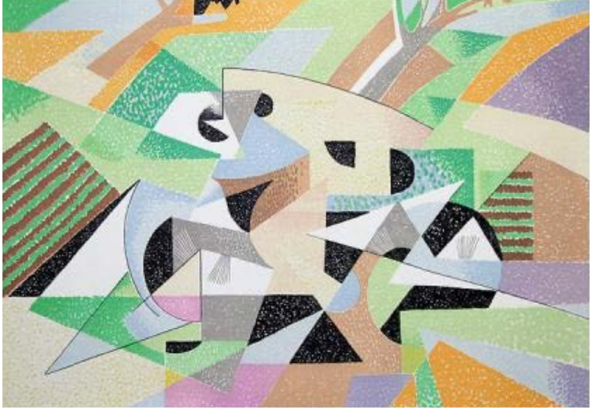
Gino Severini, The cyclist (1956)