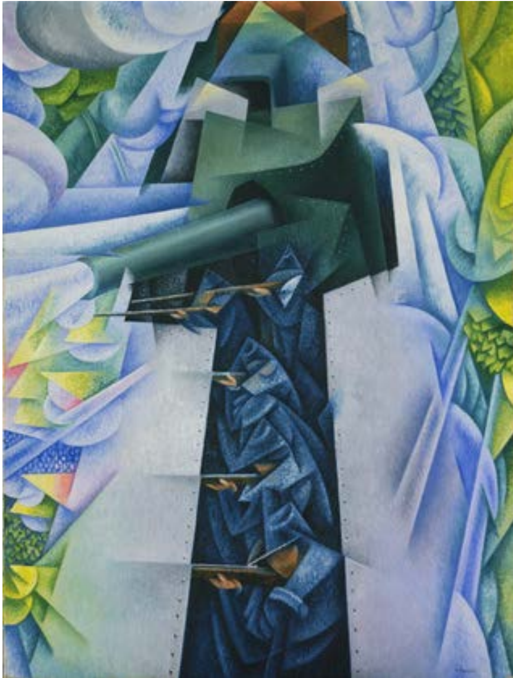
Severini, Armoured Train in Action 1915

Or this one: Armoured Train in Action . “Pure notion.”!