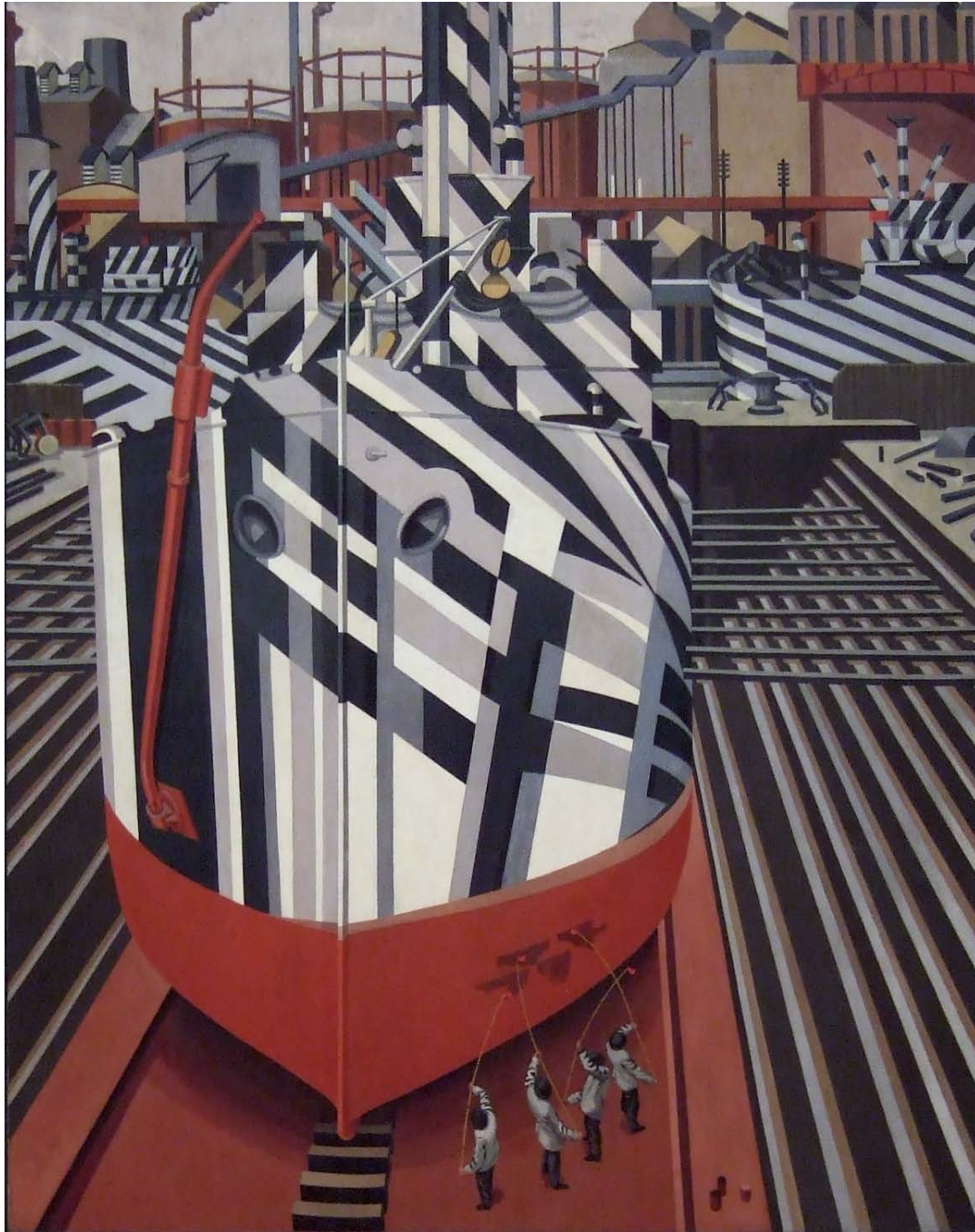
Edward Wadsworth, Dazzle-ships in Drydock at Liverpool (1919)

For example this. Dazzle Ships in Drydock in Liverpool , by the vorticist Edward Wadsworth. Now there's a war painting for you. A combination of modernism and warfare (but then you dislike both, I remember now). And think of the legal issues! Ruses de guerre . You will no doubt be familiar with Annex to Hague Convention No. IV, 18 October 1907, embodying the Regulations Respecting Customs of War on Land. , art. 23, para. (f).