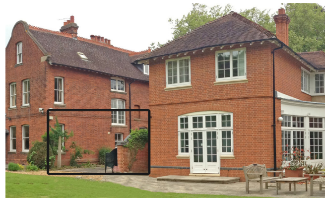
Foundations and position of the new facilities at the Lauterpacht Centre