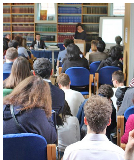
The increased space and capacity will significantly increase the Centre's ability to host the number and variety of lectures and events

The Centre is delighted to see Sir Eli's views on the continued development of the Centre's facilities gradually moving towards fruition.