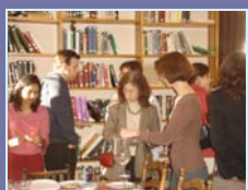
Friday lunchtime gathering before lectures begin